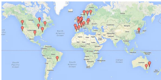
Figure 2. Location of the clinical laboratories participating in the MetVes flow cytometer comparison study

laboratories and the International Society on Thrombosis and Haemostasis (ISTH) who supported the shipping/transport of the samples.