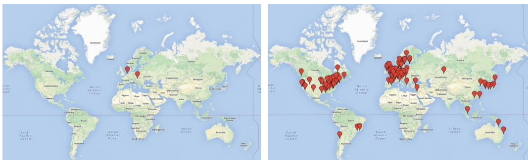
Figure 3. Left: Use of SEC in 2014. Right: Use of the MetVes introduced MV isolation procedure SEC in May 2015 (over 170 laboratories)

the project has been commercialised by partner AMC in collaboration with iZon and within the space of a year the use of the method has increased to 170 laboratories worldwide (see Figure 3).